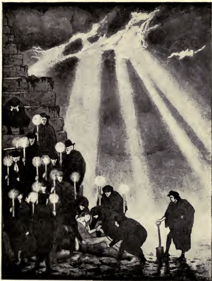
THE TERRIBLE MUD